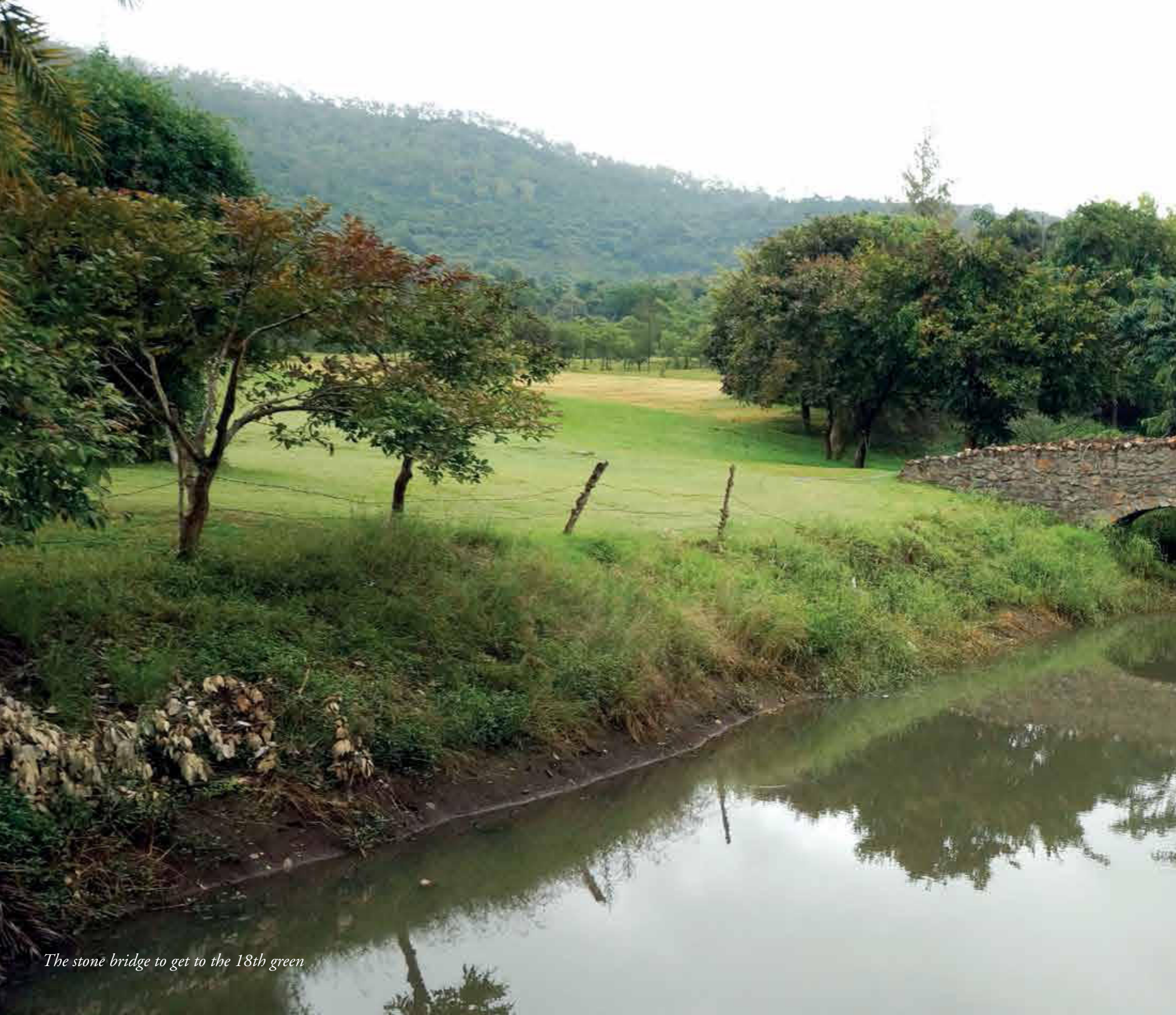
The stone bridge to get to the 18th green