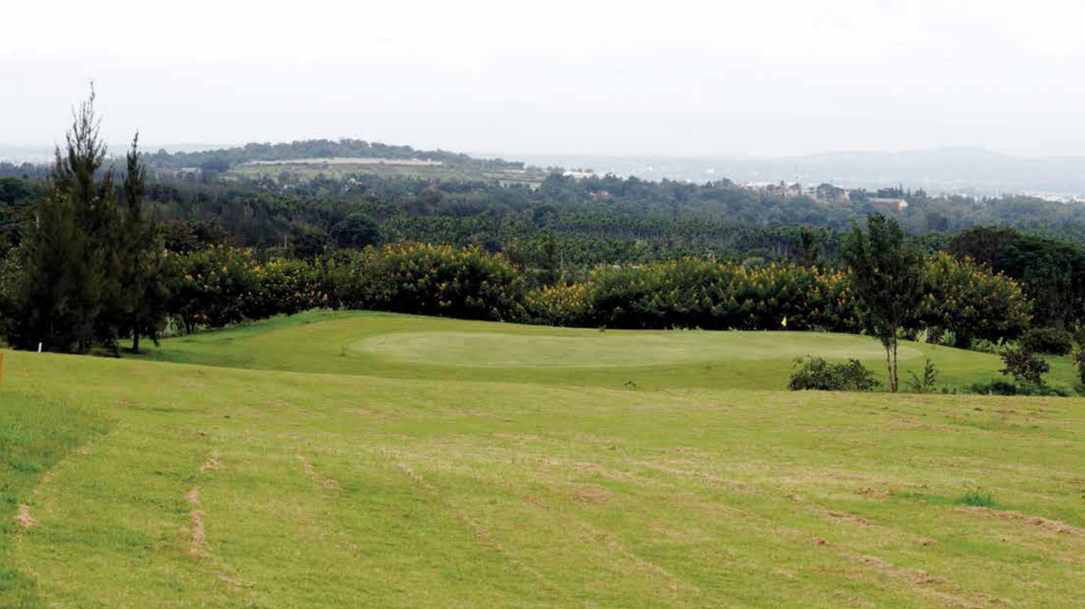
The 7th green bordered by the pretty Cassia Spectabilis flowers

People like Sudarshan deserve the highest accolades for this achievement. To build a golf course in India from scratch is a stupendous feat – overcoming obstacles of land consolidation, repurposing, government intervention, funds scarcity, etc., is no easy task. Today, the band of 51 and their admirable leader bask in well-deserved glory.