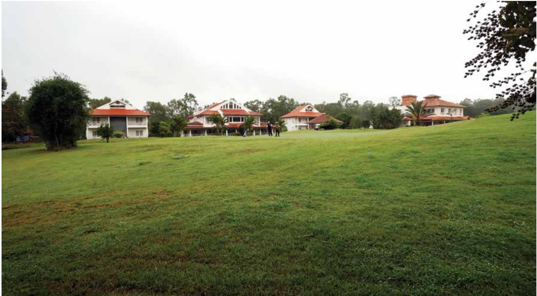
View of the clubhouse from the 18th green