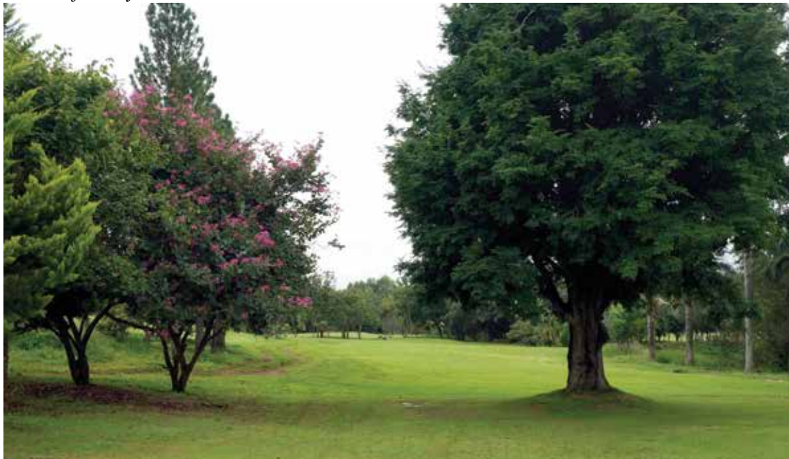
The par-3 12th hole, with trees guarding the green

Pars are generally easier on the par-4s, but very difficult to come by on the par-3s. Several of the 51 originals consider the 200-yard-long, par-3 second hole the signature hole of the layout with a carry over a chasm, OB on the left and a green, well-guarded by bunkers. They may well be right, but to me the longer par-3 fourth (215 yards uphill) seemed to be a prettier hole with more character. The entire right side of the green is protected by bunkers. With a backdrop of verdant hills and framed on either side by coniferous trees, it makes a very pretty picture indeed. And not to forget the golfing challenge – my caddie suggested a 3-wood, to hit off the tee and since I don't carry one, I had to use my driver which went long. Any par-3 which requires a big club from the tee is special!