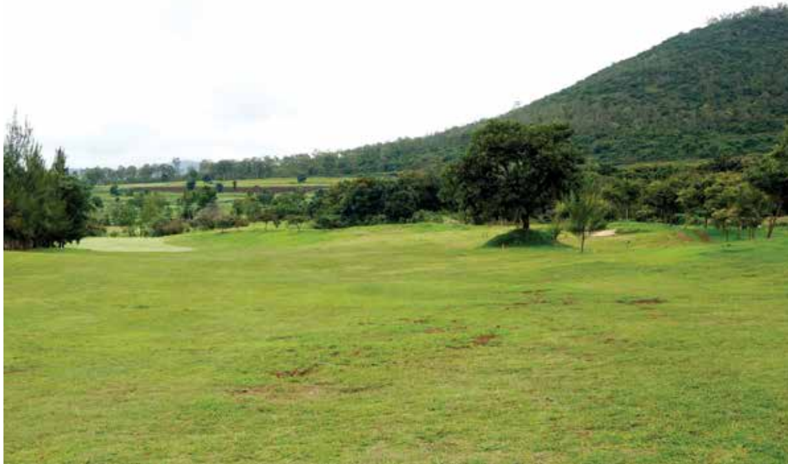
The 8th fairway