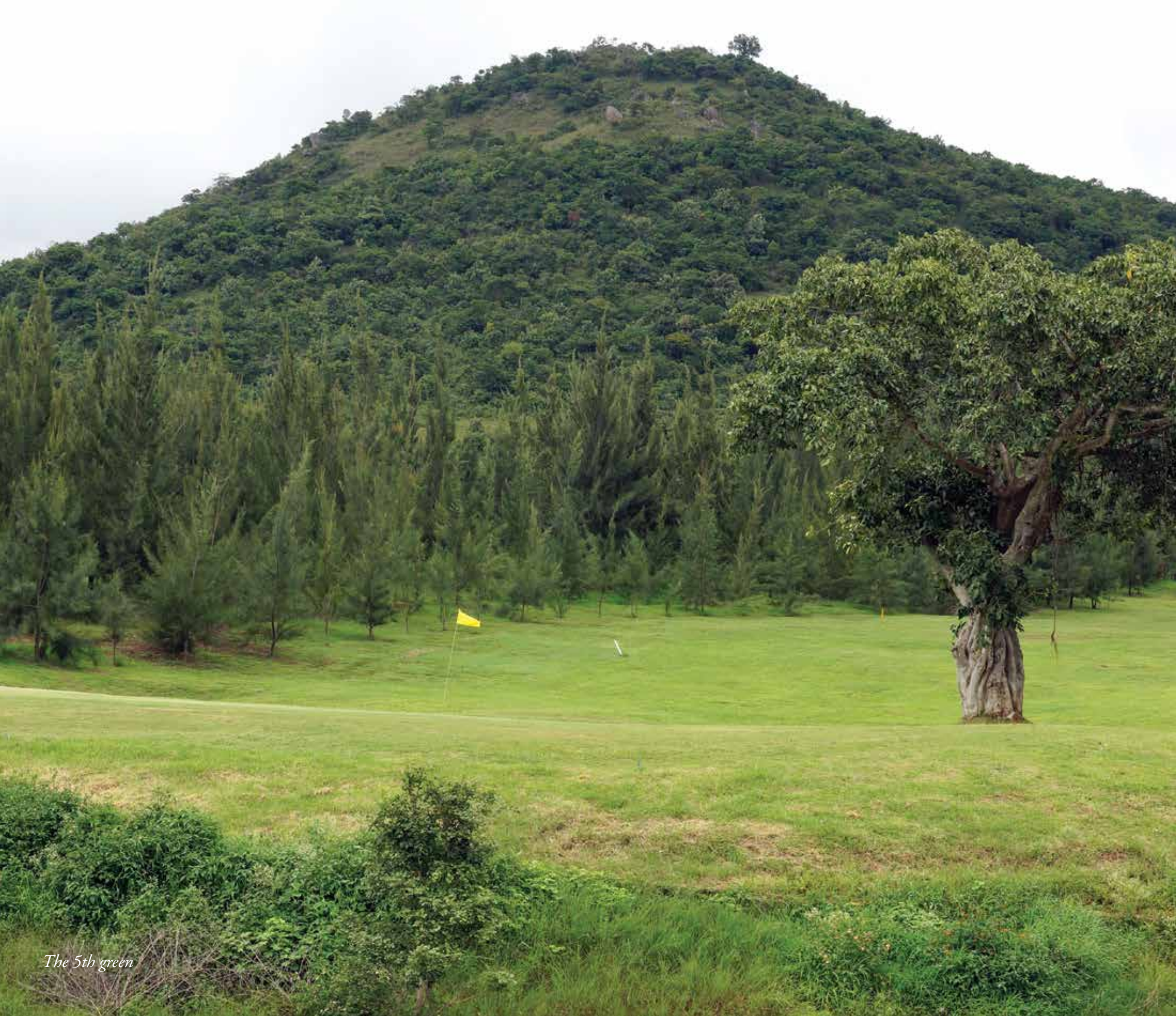
The 5th green