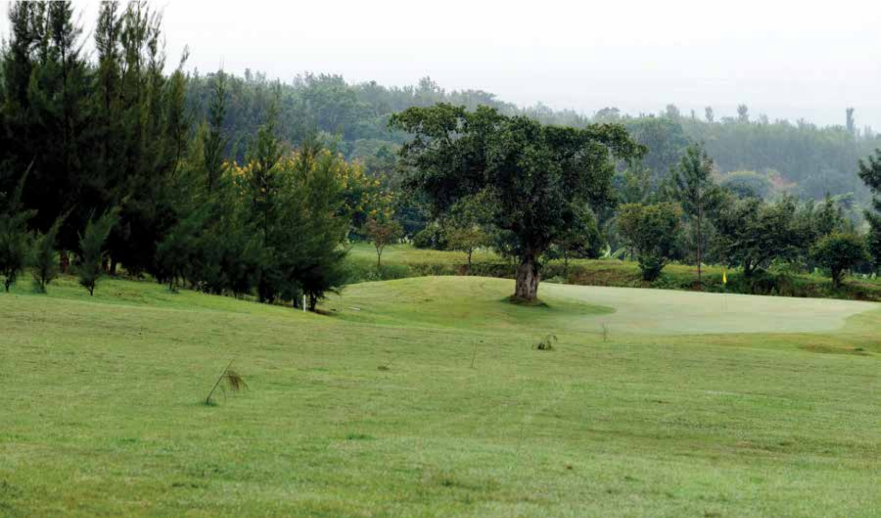
The 5th fairway and green

A 9-hole golf course was opened in 2002. The superb clubhouse was completed in 2004 and residential facilities a couple of years later. Sudarshan also went the whole hog by acquiring a further 25 acres in 2011, to expand the course to eighteen holes; an 18-hole course at the end of the day is the real deal. Ryan was called in again (this time he charged full fees!) and by 2015, Chikmagalur Golf Club (CGC) had a full-fledged golf facility on 81 acres of land. Additional amenities such as a health club with swimming pool, were soon added and now without doubt, it is a top-quality facility in every which way, comparable to the best in the land.