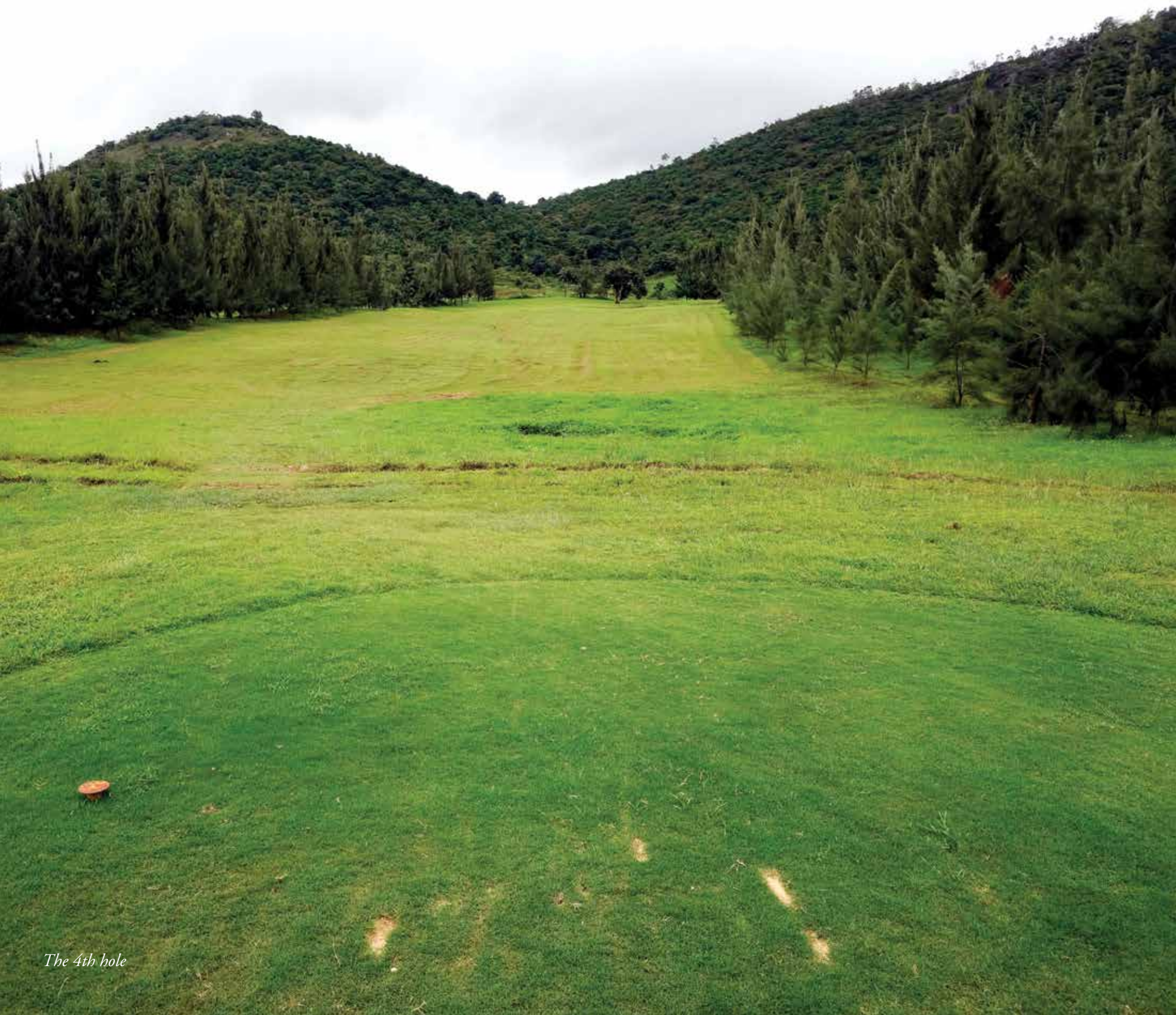
The 4th hole