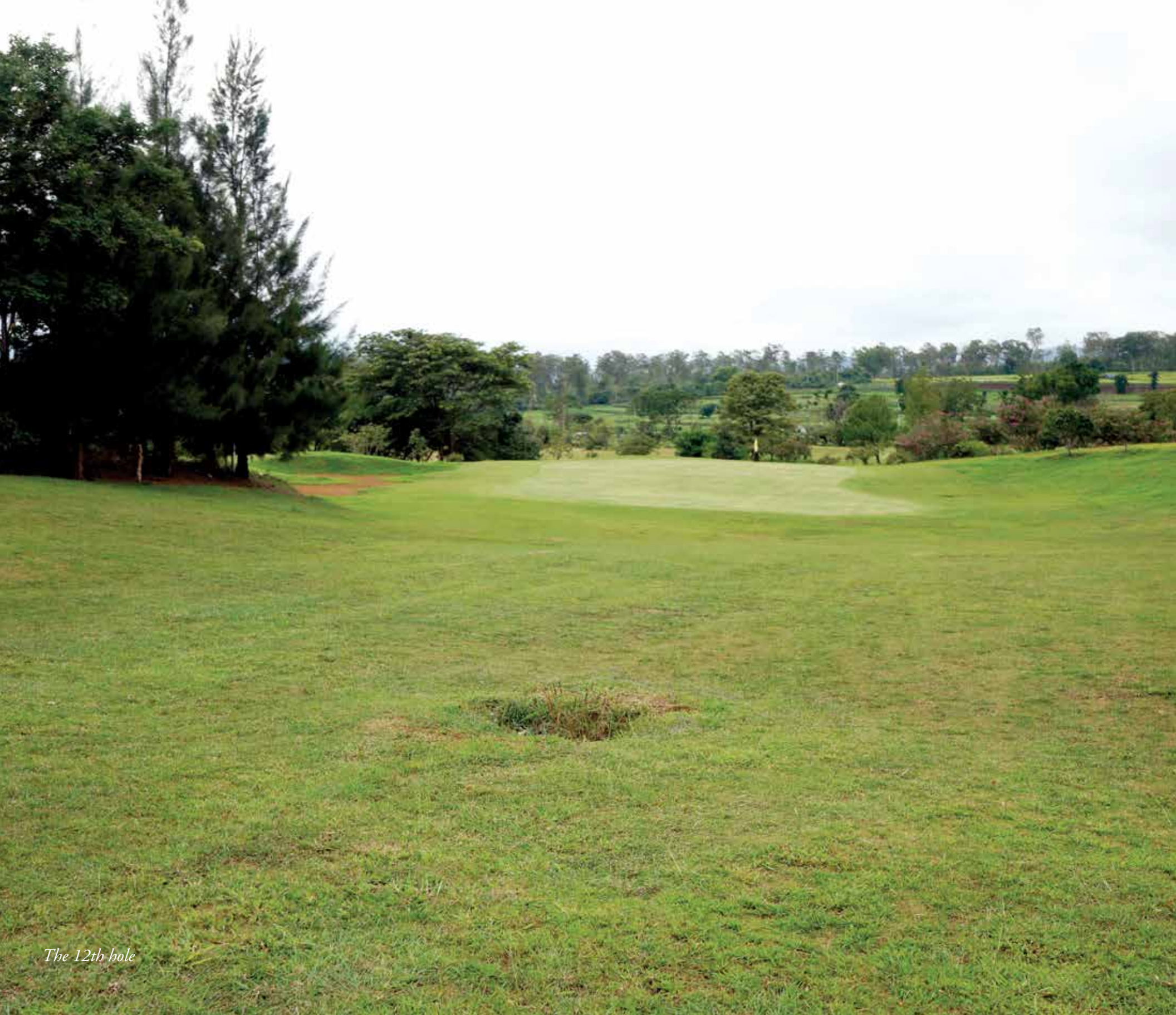
The 12th hole