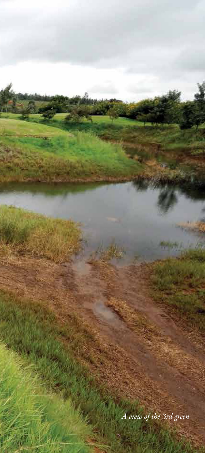
A view of the 3rd green

Overall, as already mentioned, golfers will enjoy this course if one goes by the yardstick of how they would perform relative to their handicaps and how many balls they lose in a round. On both counts, most will do fair, although it's not all a smooth sail. In order to play well, they will still have to overcome the challenges of the long par-3s and the tricky greens.