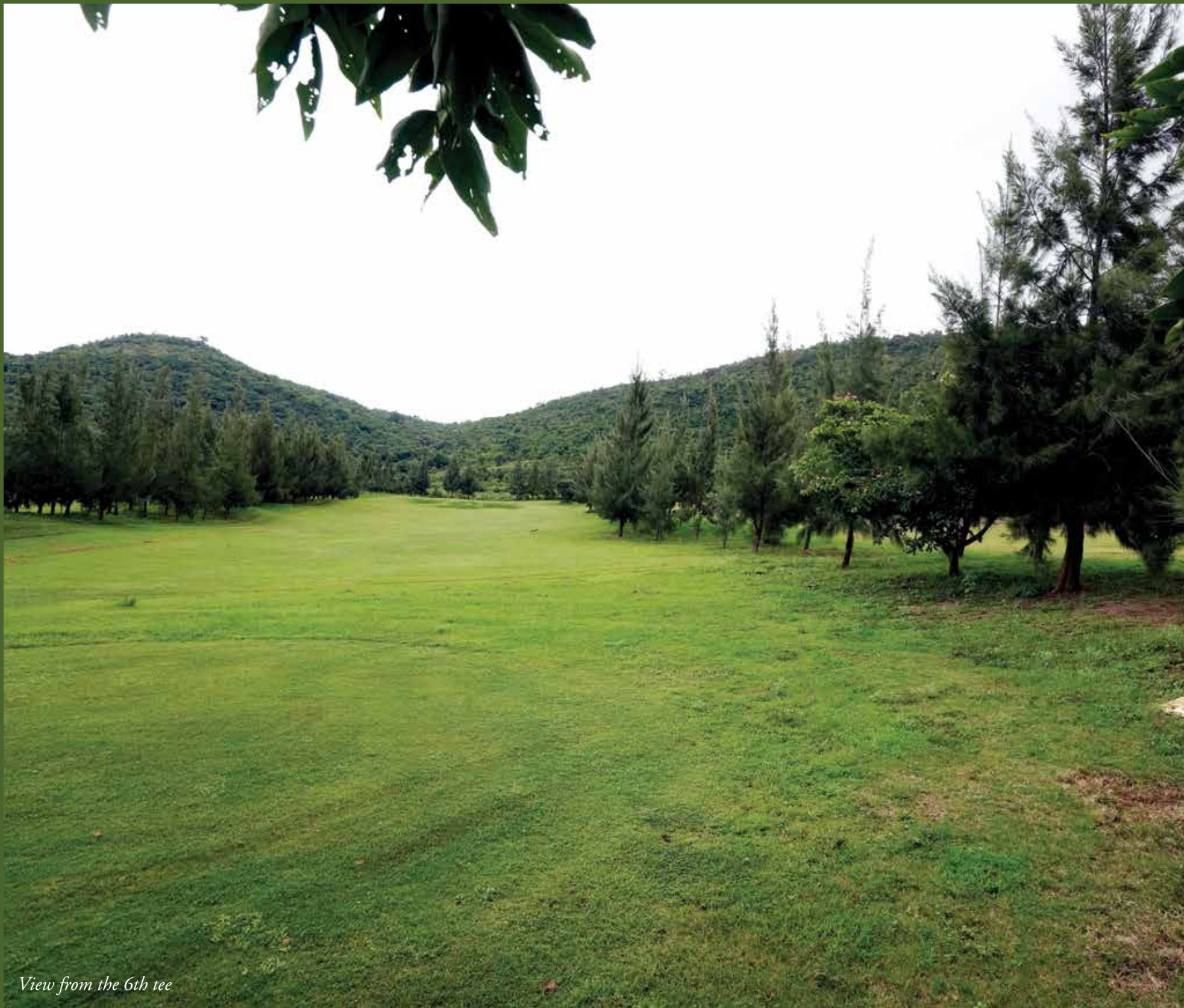
View from the 6th tee